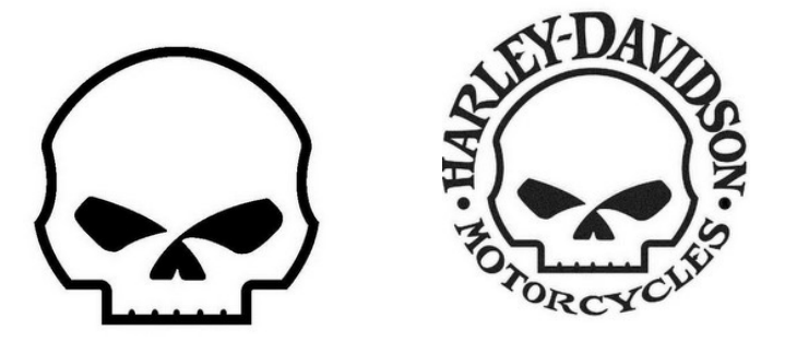
9. Since about 2008, Harley-Davidson has used its Dark Custom Logo (or variations thereof), including, but not limited to, as shown below (collectively, the "Dark Custom Logo"), for motorcycles and related products and services.